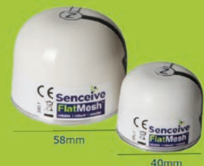
Nano and Nano+ Triaxial Tilt Sensors