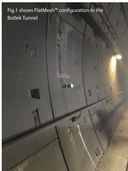
Fig.1 shows FlatMesh™ configuration in the Botlek Tunnel

required system had to meet various strict requirements; firstly, that it accurately measures angles at a resolution of 0.0001^\circ with the ability to monitor in near real-time. It also had to be easy to install, fully automatic, as well as discreet, extremely reliable and able to operate for many years without maintenance.