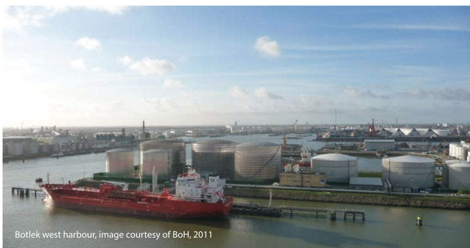
Botlek west harbour, image courtesy of BoH, 2011

In order to guarantee the safe operation of the railway, any soil movement due to the infrastructure works had to be monitored and researched to find the maximum permissible deformations of the joints between the tunnel sections in a 1.8-kilometre stretch of the tunnel. The tests estimated that the maximum movement could be up to \pm 3\text{mm} ( 2.18^\circ per tunnel element). The