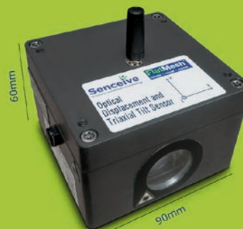
Optical Displacement Sensor (ODS)