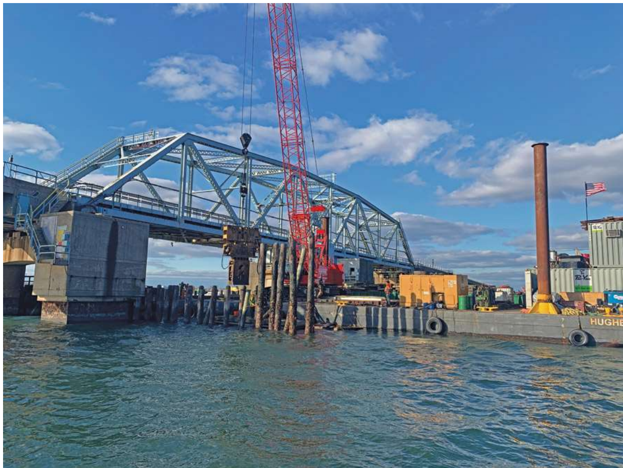
Crews remove timber piles from the bridge’s old fender system using a crawler crane operating from a barge.

“We’re repairing a lot of the damage on this bridge,” he says. “While we’re not doing any track work, we are installing piles, monitoring the bridge structure as well as tracks, and trying to limit disruptions to the riding public.”