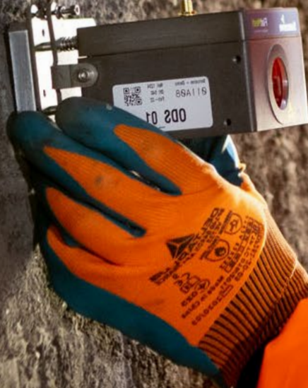
Nodes attached at various positions on the tunnel surface

It is perhaps no surprise that industry experts predict significant growth in global adoption of wireless monitoring technology.